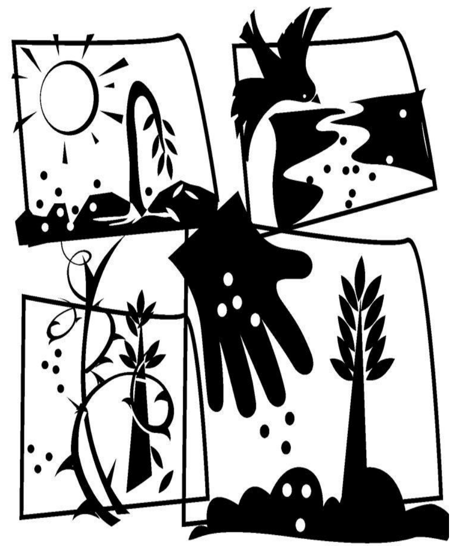
Are You Growing Grass or Killing Weeds?

Purpose Statement ~ To build a body of committed Christ-followers who demonstrate His love daily.